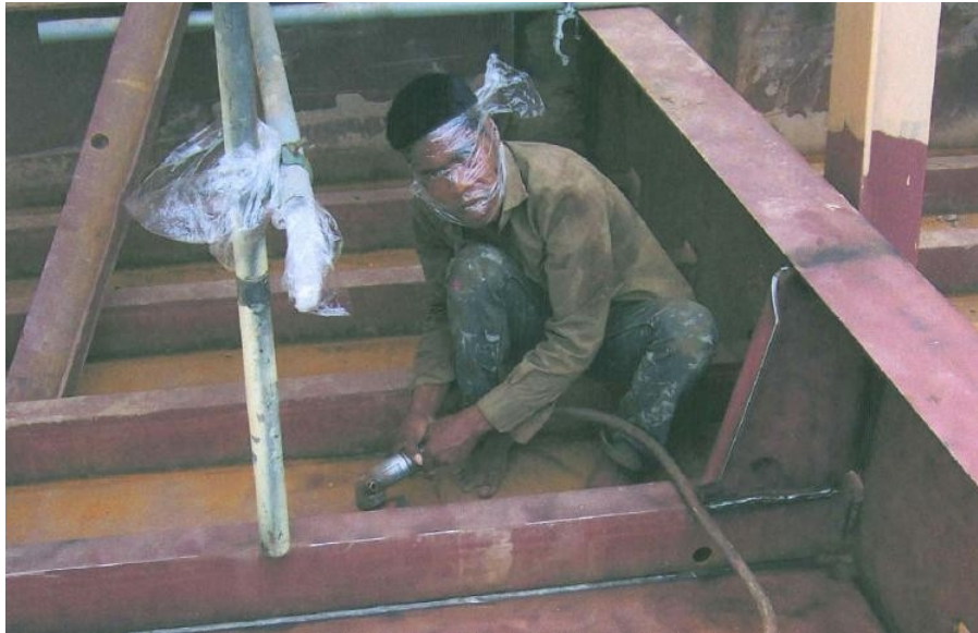
Not the most appropriate dust mask